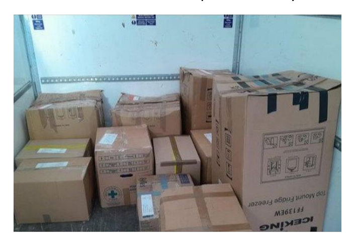
Donations starting their journey to the Ukraine

Last year, we supported the Scot Baby Box Appeal for blankets and warm clothes for children and young people in Ukraine. Thanks to all the local people who generously donated and to Northwards with their help with delivery.